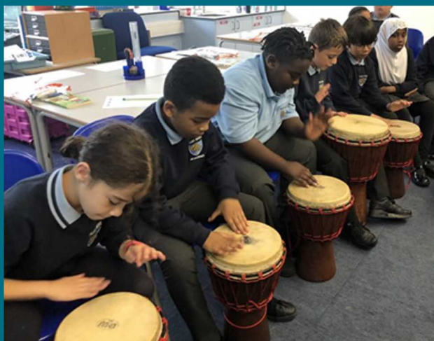
Year 5 Playing the djembe drums: