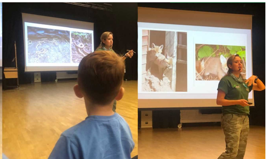
The children were encouraged to look out for creatures and animals in the garden and to take care of them by letting our grass grow and scrubs so they can live in.