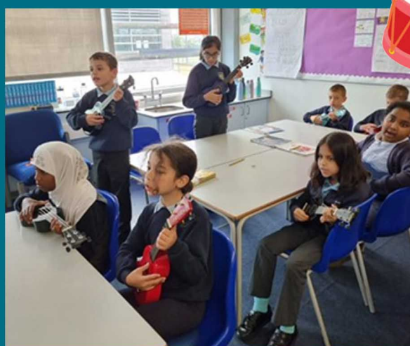
Year 5 playing the ukeleles: