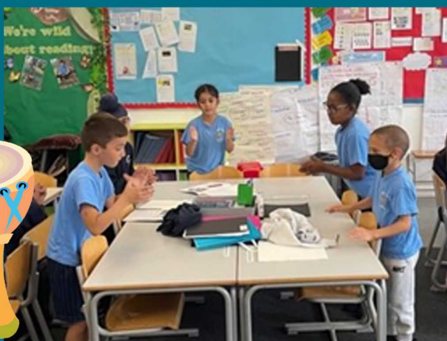
Year 3 composing body percussion: