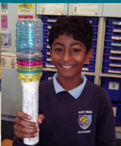
A finished maraca