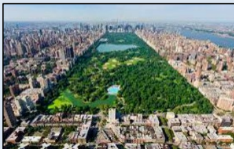
Central Park, New York

Snowball the cat enemy of Stuart and later Maragolo