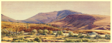
Mt. Hermannsburg by Albert Namatjira