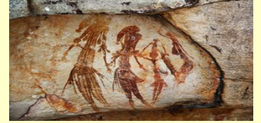
Bradshaw rock paintings found in the north-west Kimberley region of Western Australia