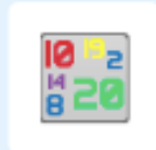
Statistics and reports

To learn how to search for information in a database.