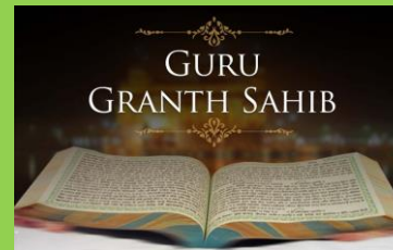
The holy book