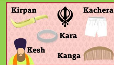
The 5 ks