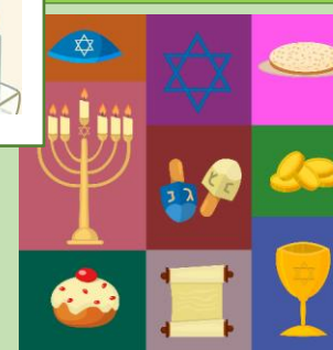
Symbols of different festivals