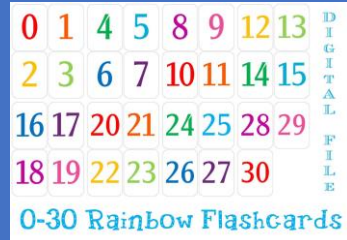
Numeros del doce al treinta