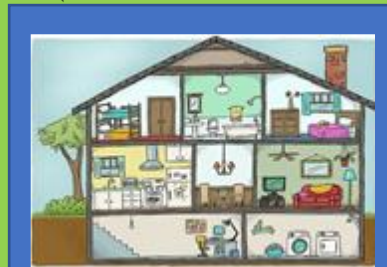
Las Partes de mi Casa!