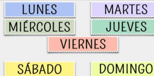
Dias de la semana