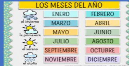
Meses del Ano