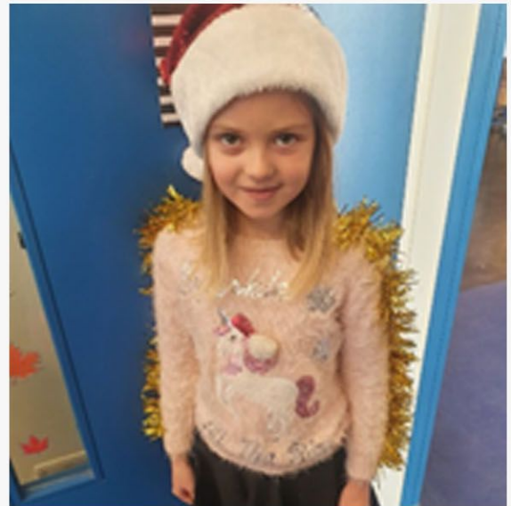
KEY STAGE 1