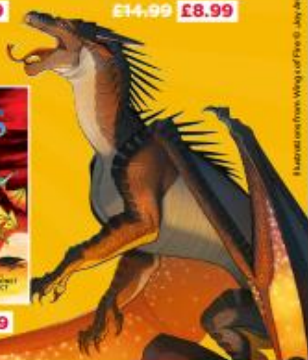
Illustration from Wings of Fire © Jay Ang, 2023