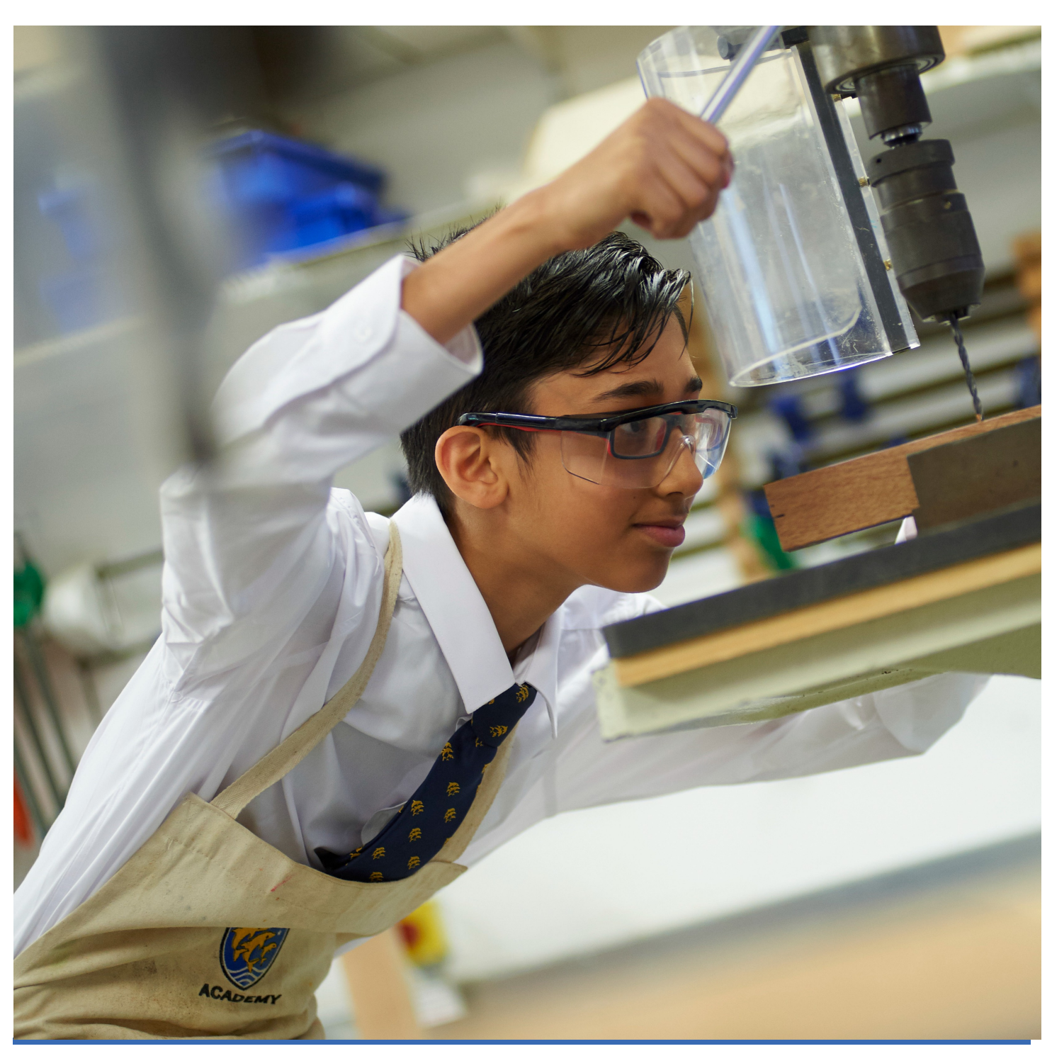
PROUD TO LEARN