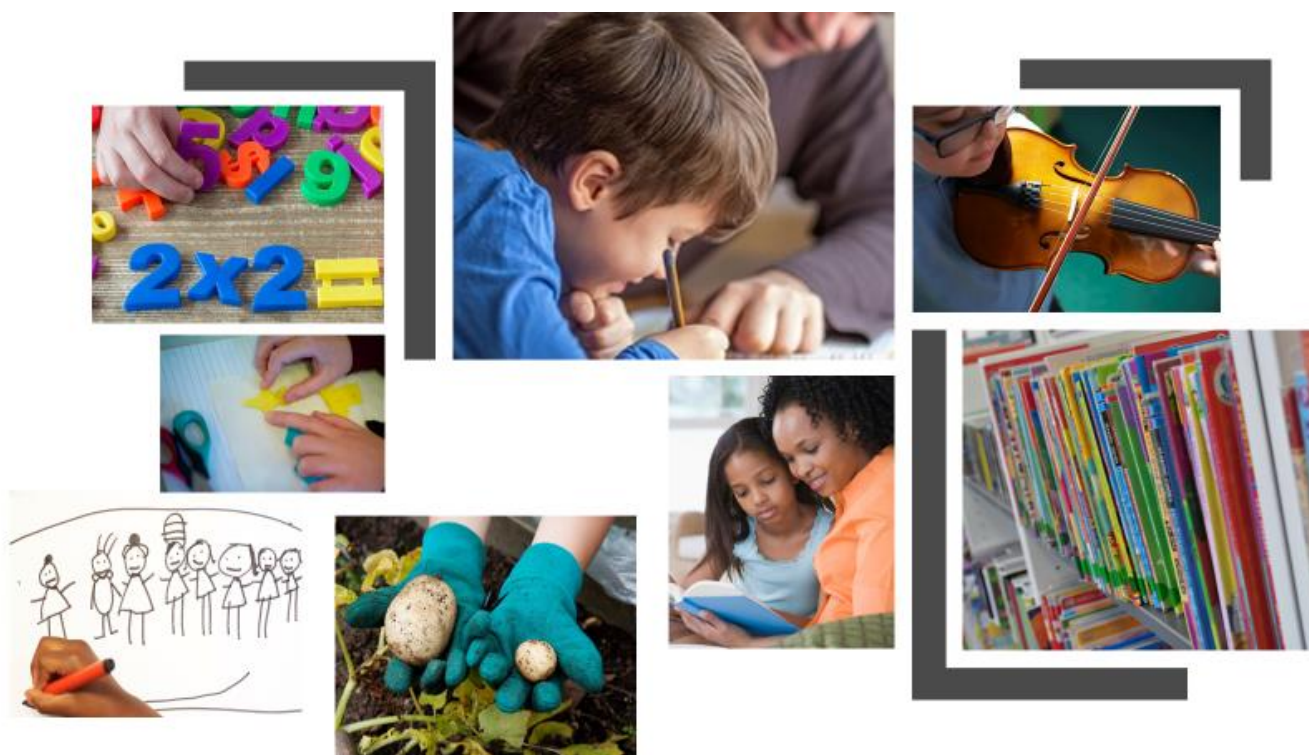
Pictures: boy and father writing, mother and daughter reading, other photos