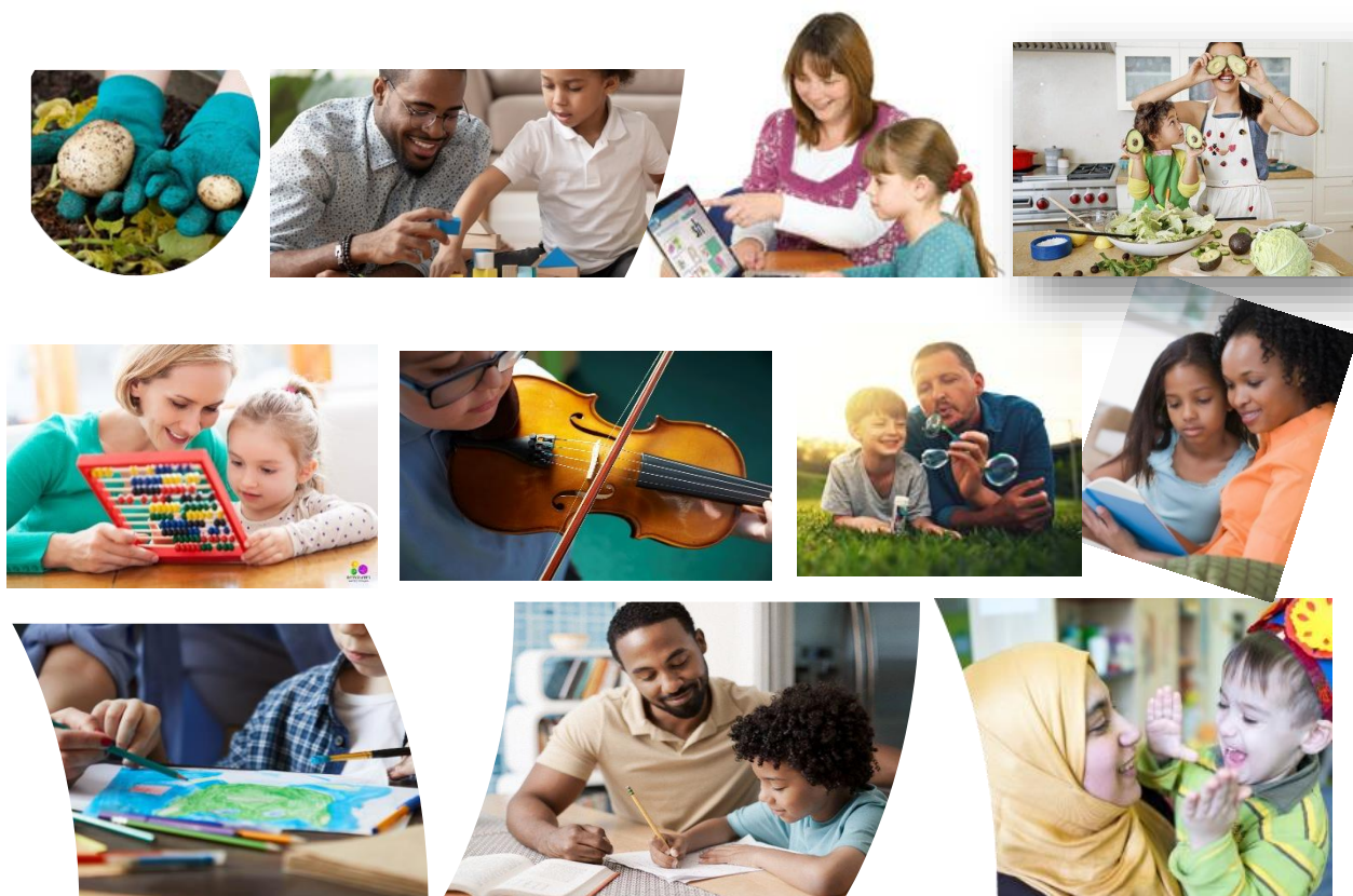
Pictures: hands gardening and boy playing violin (Ealing images) other pictures (google images)