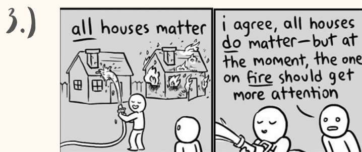
illustration credit: Kris Straub